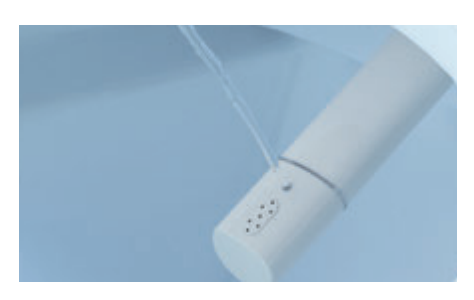
Rear wash: Designed to offer thorough cleaning and hands-free hygiene