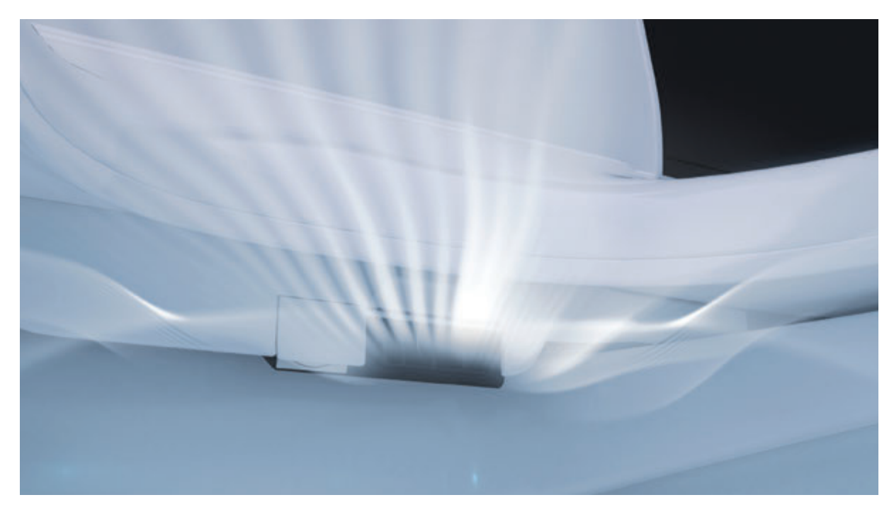
Dryer: Warm air drying for convenience, comfort and complete hygiene