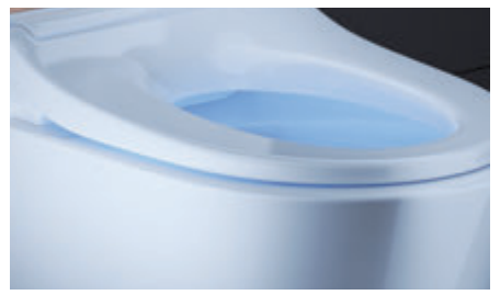
Anti-bacterial clean glaze: A surface that prevents the growth of germs and is easy to clean too