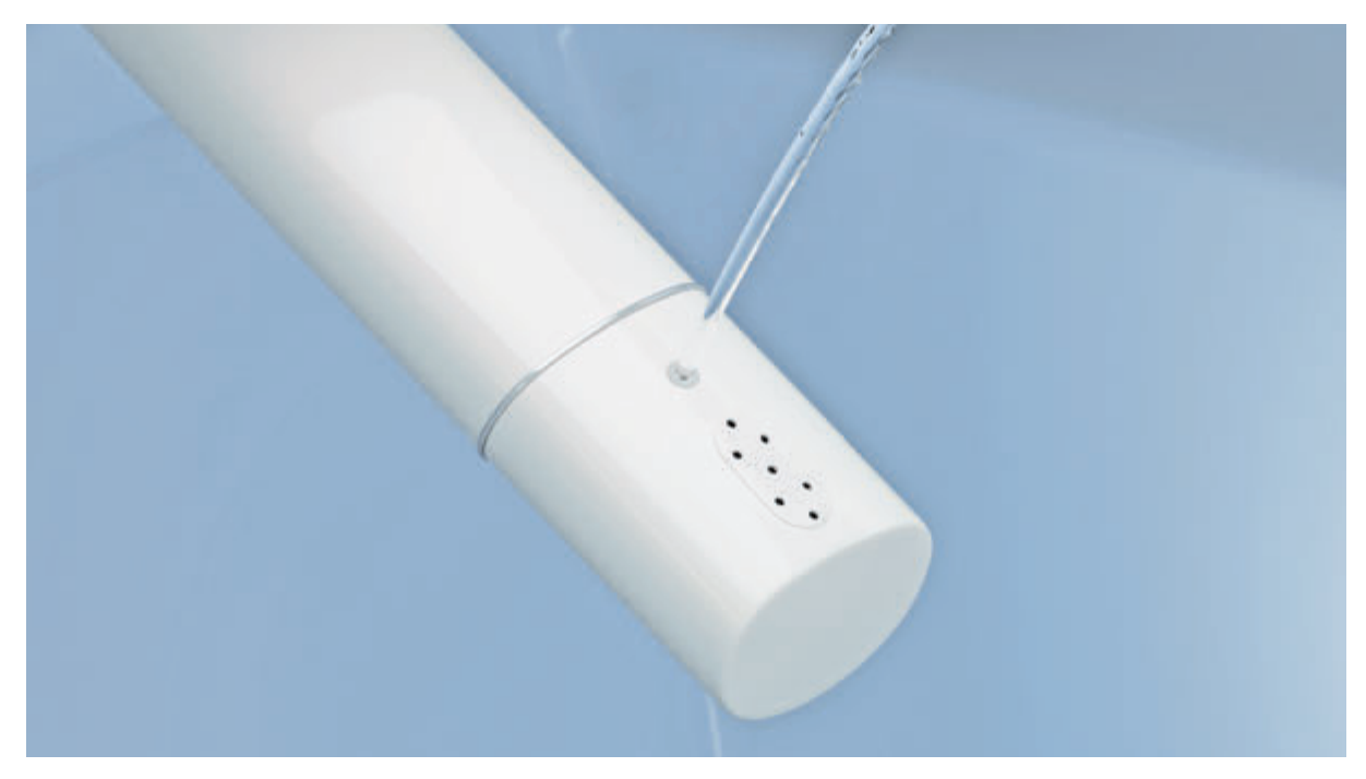
Nozzle oscillation: The oscillating nozzle feature, and its adjustable position, offer thorough cleansing